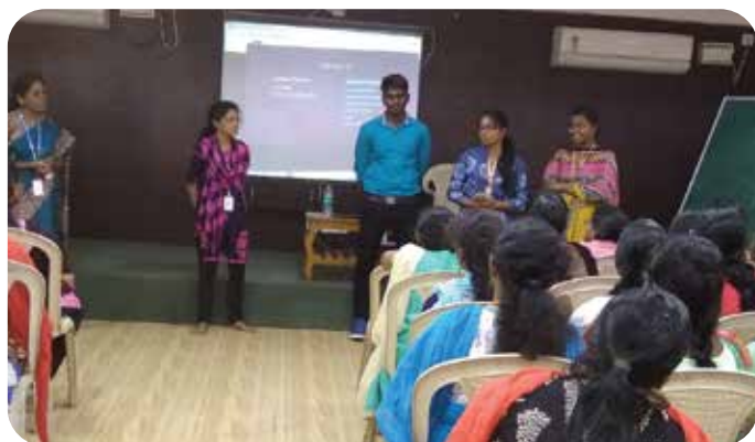
T.I.M.E. Bank Recruitment Exams Coaching @ SKPC

Software Engineering Associate, IT Trainee, System Analyst, System Programmer, Web Designer.