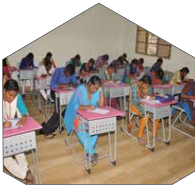
Aptitude Test Job Fair