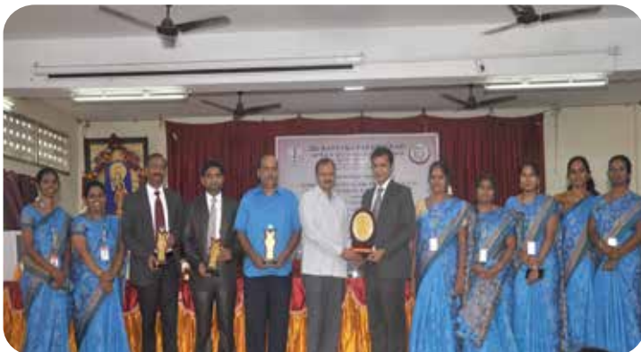
T.I.M.E. Bank Recruitment Exams Coaching @ SKPC

Entrepreneur, Business Analyst (Securities & Risk), Accountant, Employment in H.R., Banking, Insurance, Free Lancer, ITES Companies, Multi National Companies.