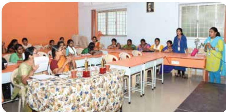
T.I.M.E. Bank Recruitment Exams Coaching @ SKPC