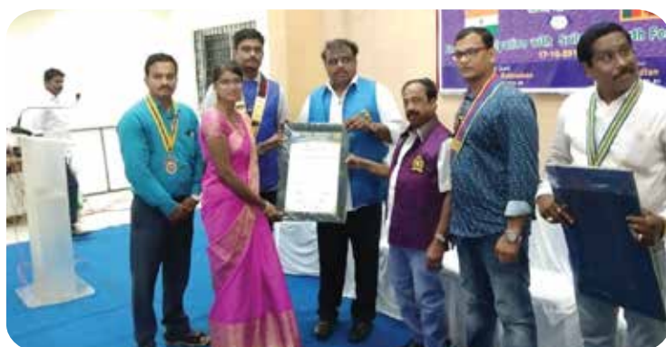
T.I.M.E. Bank Recruitment Exams Coaching @ SKPC

Teachers, Corporate Trainers, Course Developers, Freelance Writers, Translators, Content Writers, Content Verifiers, in IT or Digital Marketing Sectors, Reporters and Editors in Newspapers, Theater, Media and Entertainment, Advertising and Public Relations BPOs and KPOs, Govt. Jobs in Non Technical Sectors.