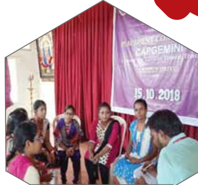
Group Discussion Capgemini