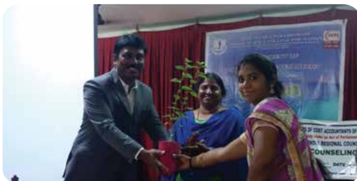
T.I.M.E. Bank Recruitment Exams Coaching @ SKPC

Accounting & Finance, HR, Marketing, Law, Banking, IT Companies, Secretarial firms, Consultancies, etc.