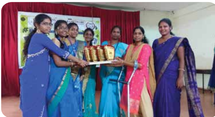
T.I.M.E. Bank Recruitment Exams Coaching @ SKPC

IT sector jobs, Asst.Professor in the Colleges and Universities after PG in Mathematics, Teacher in schools after B.Ed., Banking, Post Office jobs etc., Assistant Statistical Investigators, Insurance Sector jobs, Jobs in BPOs/Call centers, Government Services, Civil services like IAS, IPS, can enroll as online teachers.