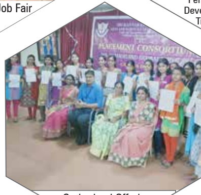
Sutherland Offering Letters