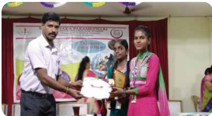
T.I.M.E. Bank Recruitment Exams Coaching @ SKPC

Analyst, Relationship Manager, Credit Control Manager, Tellers, Branch staff, Customer care Executive, Corporate Banking Executive, Tax Consultant, Audit Assistant, Insurance Advisor, Treasurer.