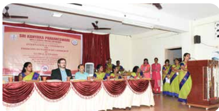
T.I.M.E. Bank Recruitment Exams Coaching @ SKPC