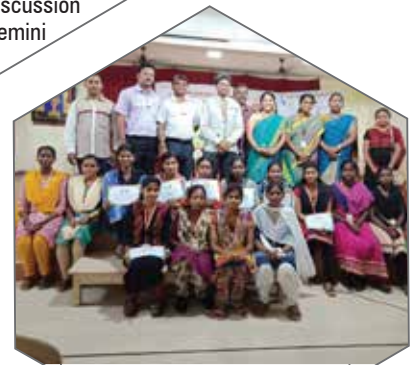
Personality Development Training