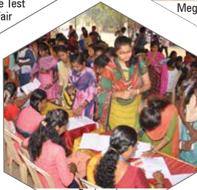
Registration Mega Job Fair