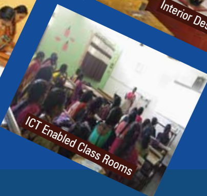
ICT Enabled Class Rooms