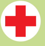
Youth Red Cross

Youth Red Cross programmes, are an integral part of the strategic approach; we value the diverse and important roles that young people perform as innovators, inter-cultural ambassadors, peer educators, community mobilers and most importantly agents of behavioural change and advocate for vulnerable people