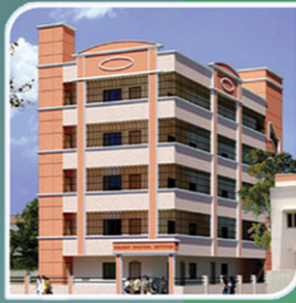
Boys College Campus