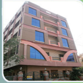
Boys Residential campus (2)