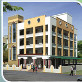
Girls Residential Campus