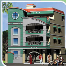
Girls College Campus

1 Branch single Recognition Code(09059) @ Murliraos in tirupati