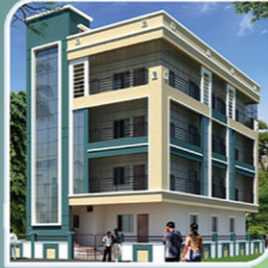
Boys Residential campus (1)