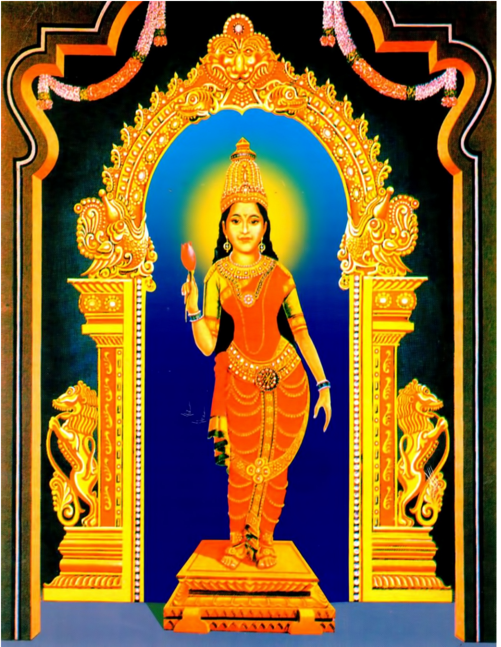
SRI KANYAKA PARAMESWARI