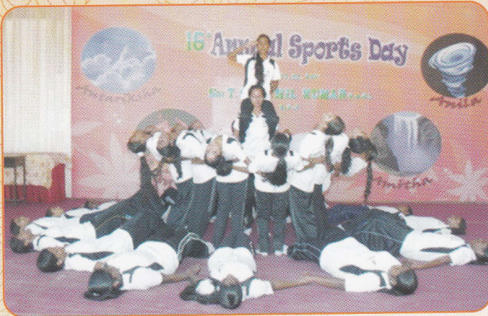
Delighting the Audience with Splendid Act.